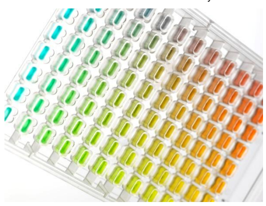
A 4 corner gradient plate for protein crystal optimisation created using TTP Labtech's dragonfly.

Following selection of the primary conditions which resulted in crystal formation, a 4-corner solutions protocol was employed in a 96-well plate, where concentrations of the precipitant (PEG) and the additive (propanediol) were varied based around the initial screen conditions. This protocol produced concentration gradients across a crystallisation plate, where each well of the plate received appropriate volumes from four stock solutions individually.