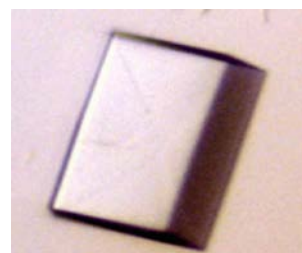
Figure 1. Examples of successful crystallization with Morpheus® (with the permission of Pobbati A., Low H. and Berndt A.)